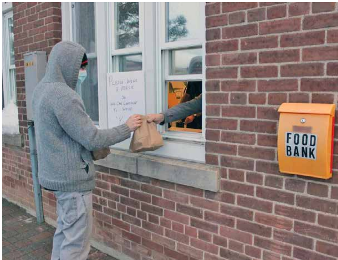
Distributing food during COVID at the breakfast program of Holy Trinity, Welland.