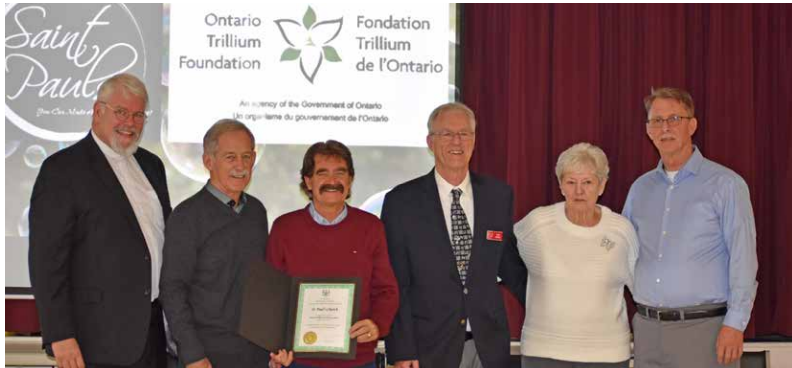
The committee that spearheaded the clean air project at St. Paul's, Fort Erie.