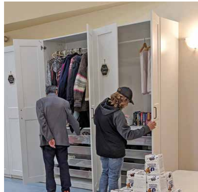
Visitors to Cathedral Café can also access a clothing cupboard in the space.

St. Matthew's House is a unique community support agency that provides childcare services and support services to older adults 55+. Many of the people and families that it serves face barriers that it helps them overcome through its programs and services. SMH works in the heart of the Hamilton's most challenged neighbourhoods, with people facing, on average, the highest rates of poverty in the city. This is associated with the highest rates of ill-health, mental illness and limited education levels.