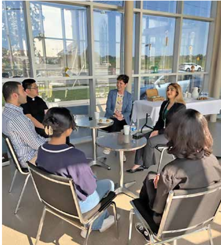
St. Luke's Palermo is a mixed ecology parish, where a bilingual Mandarin congregation serves alongside the Sunday morning Holy Communion Service.