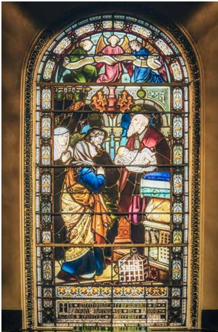
Presentation of Christ in the Temple, First Presbyterian Church, Belfast.

And then there is Anna. She was looking for “the redemption of Jerusalem.” She believes that Jerusalem needs to be redeemed—ransomed—from some kind of captivity. It could simply mean that, like many people at that time, she is waiting for the Messiah to come and throw out the Romans, to “redeem” Jerusalem in that sense. But, later in the story, Jesus will say that he has come “to give his life a ransom for many”—a totally different kind of redeeming. Like Simeon, Anna recognises that this baby is somehow connected with